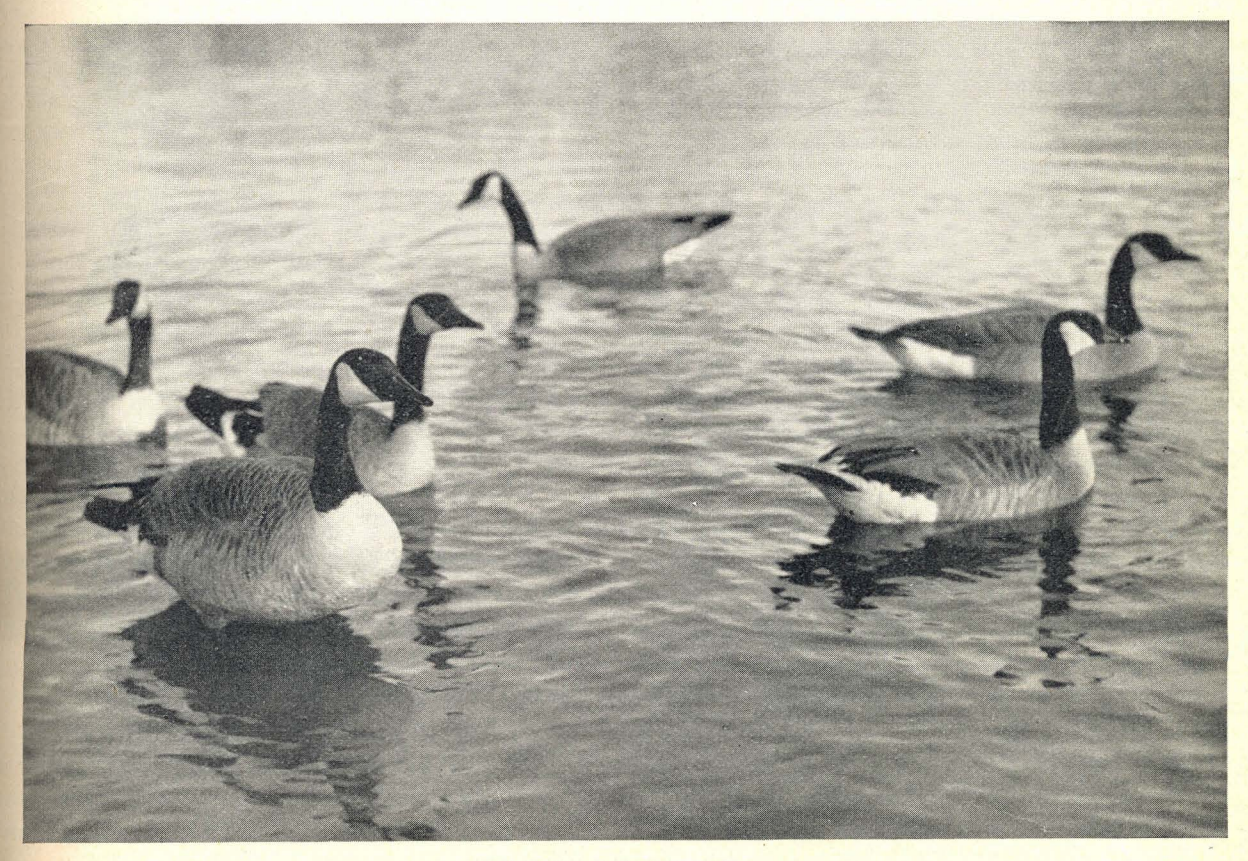
GEESE ON A STATE LAKE

Beaver and otter are protected under the Kansas law. The law provides also that no person shall use in the aggregate more than thirty steel traps, snares, deadfalls or other devices.